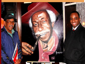
Historical Black Press Foundation's commissioned painting of the late Gordon Parks unveiled at Black Wax Museum in September 2006.

Using technology and traditional methods, the Black Press has taken its fight to the Internet and reaches some 52 million readers on a weekly basis.